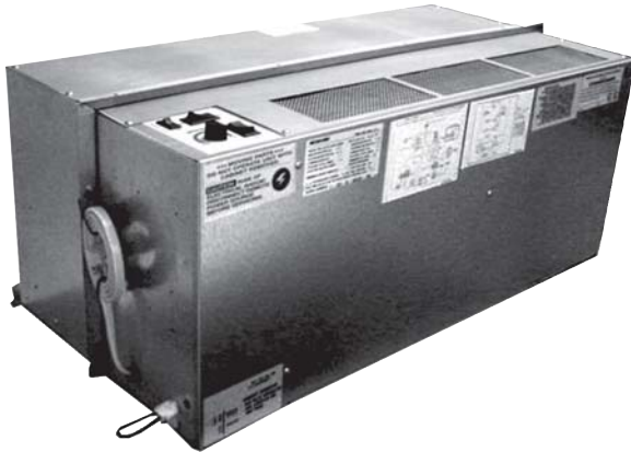
COOLING ONLY/HEAT PUMP Nominal Capacities: 9,000 - 18,000 Btuh

Replacement For Friedrich/Climate Master 702 & 703, Weather Twin, TPI RA Matic, Zoneaire, and Others