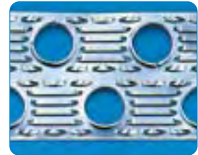
Hydrophilic Coated Aluminum Fins