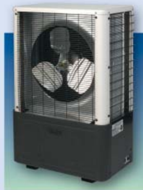
Side Discharge Condenser