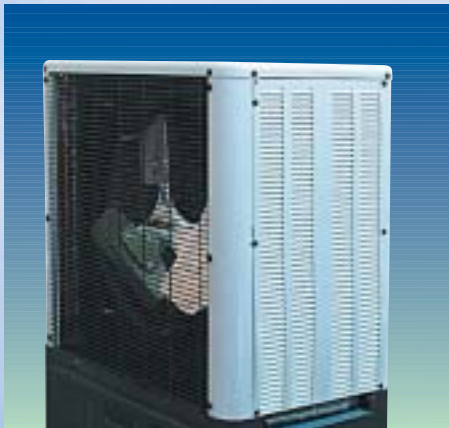
Hail Guard/Wind Baffle Accessory