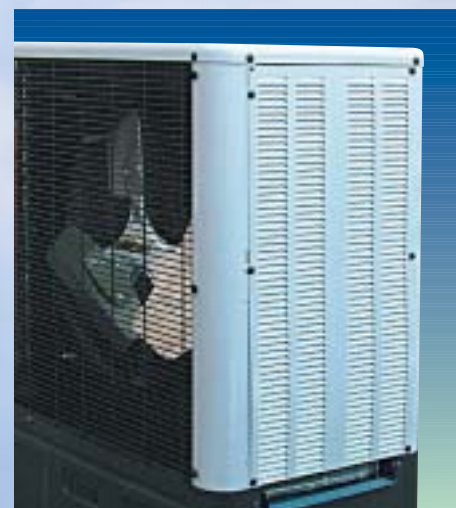
Hail Guard/Wind Baffle Accessory