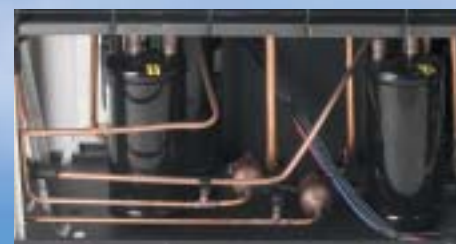
Independent Refrigerant Circuits