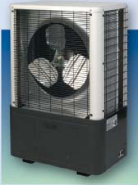
Side Discharge Condenser