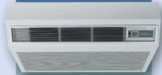
Universal Floor Mount Air Handler