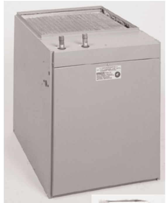
OPTIONAL A-COIL CONFIGURATION

One year parts, 5 year coil warranty is standard.