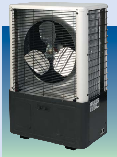
Side Discharge Condenser