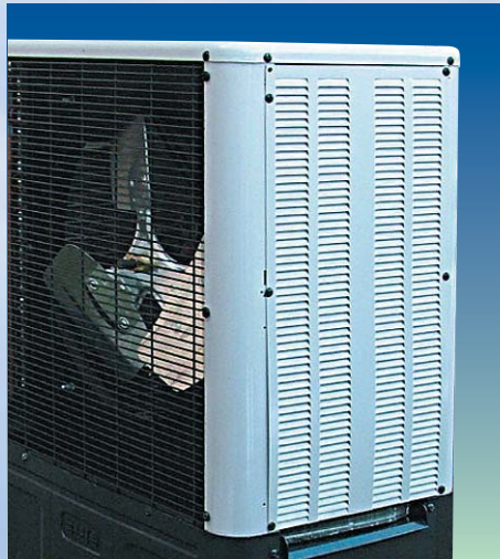
Hail Guard/Wind Baffle Accessory