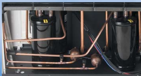
Independent Refrigerant Circuits