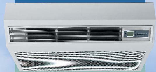
Universal Floor Mount Air Handler