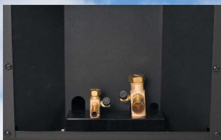
Service & Refrigerant Line Connections